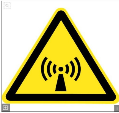
Caution non-ionizing radiation